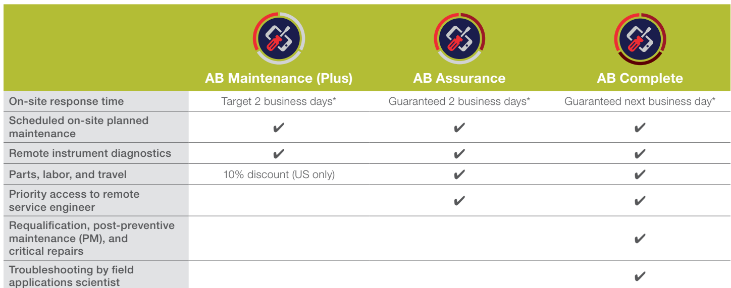
Table 1. Service plans at a glance.